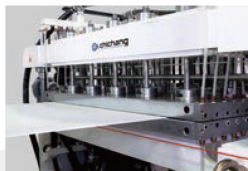
Vacuum Calibration Unit