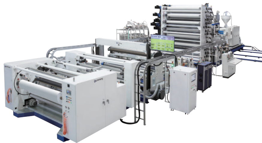
Automatic Cast PE Breathable Film Extrusion Line