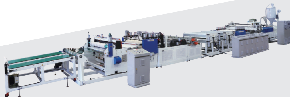
PP / PC Hollow Profile Sheet Extrusion Line