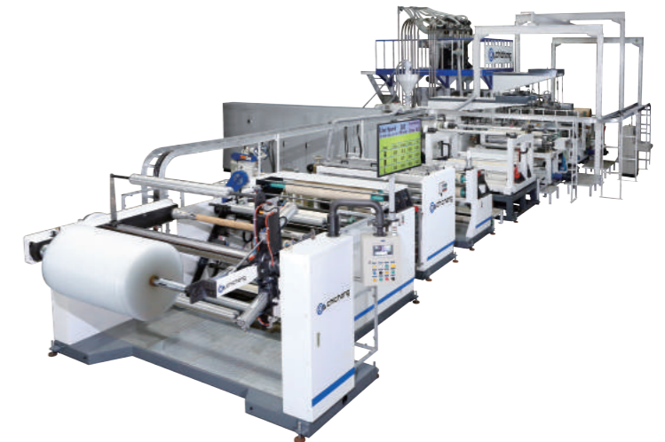
3-Layer Air Bubble Machine