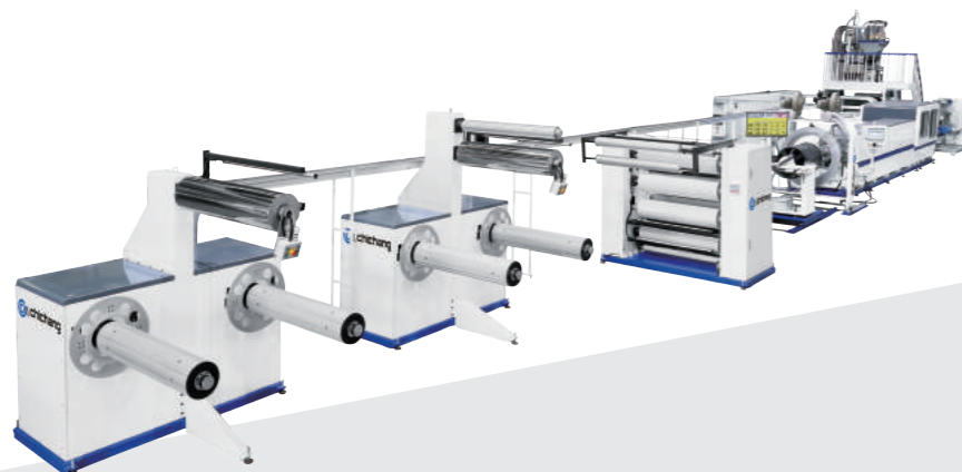
PS / PE Foam Sheet Extrusion Line